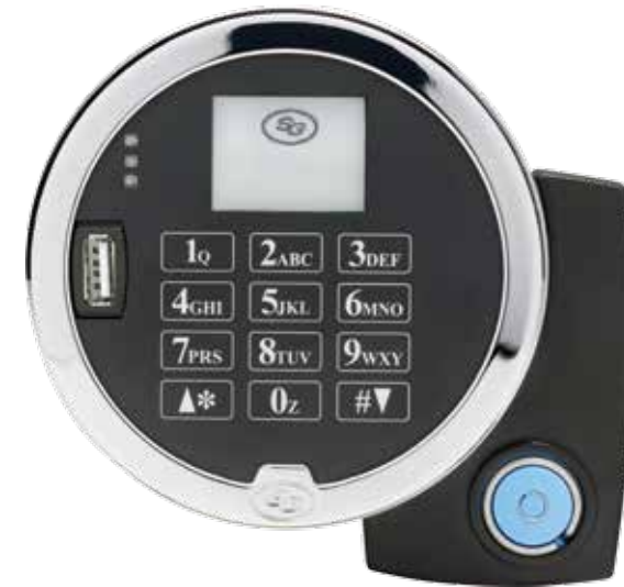
A-Series with Display

A-Series Locks store time in the lock, not on the key. This ensures that A-Series Locks are not susceptible to time drift, a critical feature that keeps A-Series audit trails highly accurate and reliable.