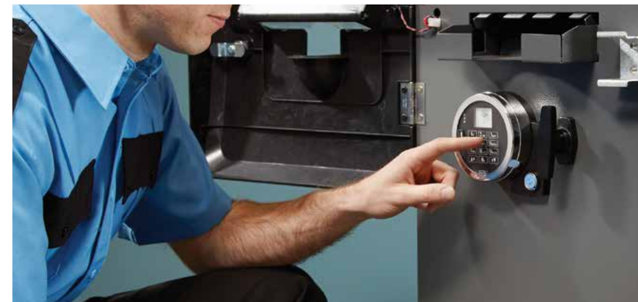
A quicker, easier, more intuitive solution for ATM security.

Multiple visual elements including extra-large display screen and keypad indicator lights, combined with the beeps and braps used by all A-Series Locks, enhance the user's ability to understand, process, and act on information quickly and accurately.